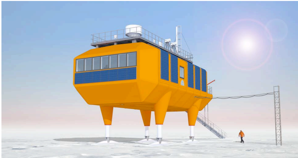
Figure 5. CGI visual of the Atmospheric Watch Observatory at Summit Station

The Atmospheric Watch Observatory (AWO) has been designed to provide year round state-of-the-art laboratory facilities for atmospheric and snow chemistry research. The energy efficient, aerodynamic design maximizes flexibility to suit the ever-changing needs of the scientific research. Internally the layout provides an open plan laboratory, warm-up lobbies for personnel and cargo, a plant room and a small WC and emergency store (in case scientists have to stay over night in the module due to bad weather). As the laboratory conducts sensitive aerosol experiments it is crucial that air pollution is kept to an absolute minimum. All personnel need to either walk to the module from the main base (over a mile away) or use electric powered skidoos.