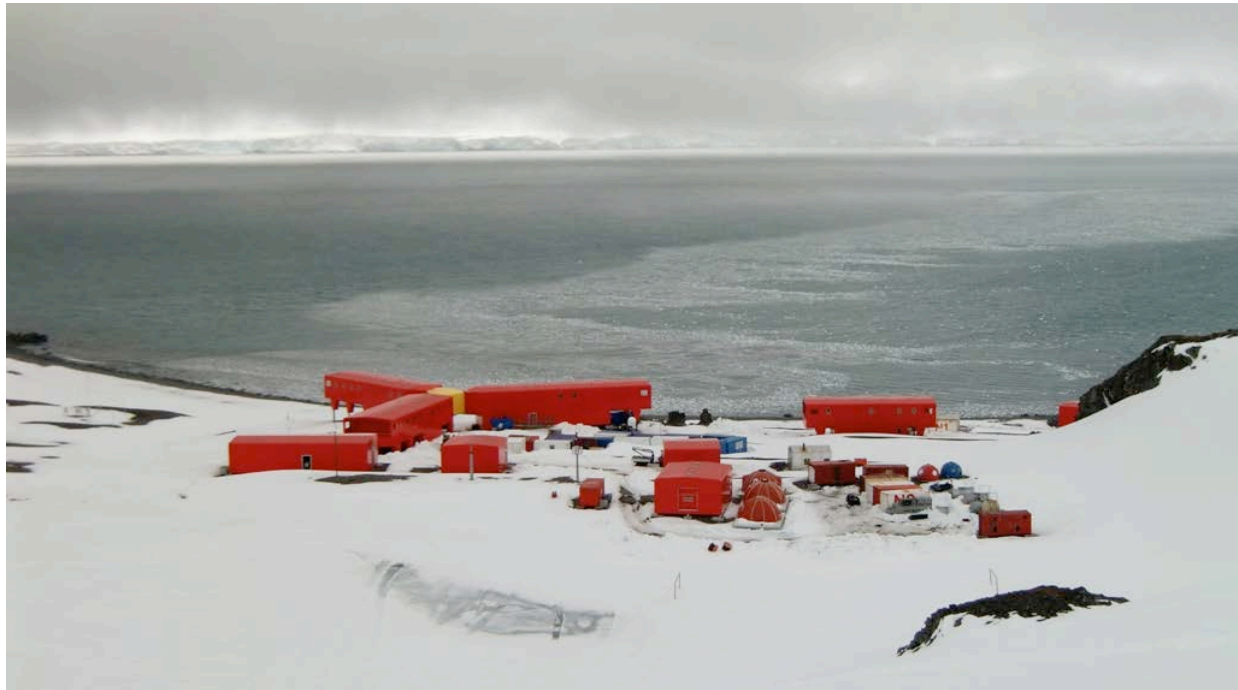
Figure 7. View of the construction site for Juan Carlos 1 Antarctic Research Station