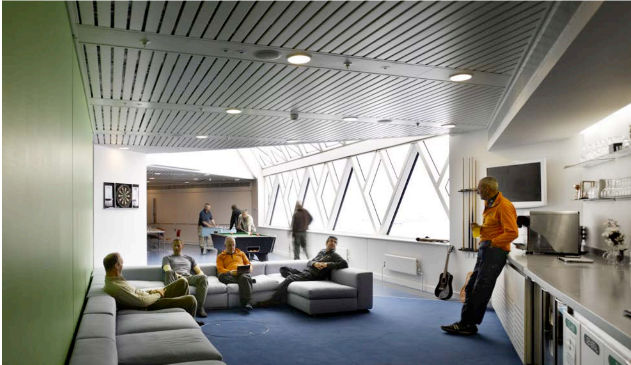
Figure 2. Naturally lit social area within the station's Central Module

Bedrooms, laboratories, office areas and energy centres are housed in standardised blue modules. A larger two-storey light-filled red module provides the social heart of the station and is used for living, dining and recreation. The main window to this module combines clear triple glazing with nanogel insulated glazing to maximise light penetration whilst minimising heat loss. The lower level is open plan to encourage a sense of community. The upper level rooms include special domed rooflights providing spectacular views of the Aurora Australis in winter. The layout also incorporates medical operating facilities, air traffic control systems and CHP power plants and is a microscopic self-supporting infrastructure-free community.