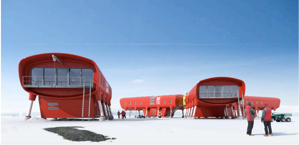
Figure 6. CGI visual of the new Juan Carlos 1 Antarctic Research Station

The location and orientation of the buildings makes best use of the site topography and aspect, with windows framing views of the surrounding land and seascapes. Within the buildings the modular approach maximises flexibility for growth and change so that the new station can continue to respond to the changing needs of Antarctic scientists for 20 years or more.