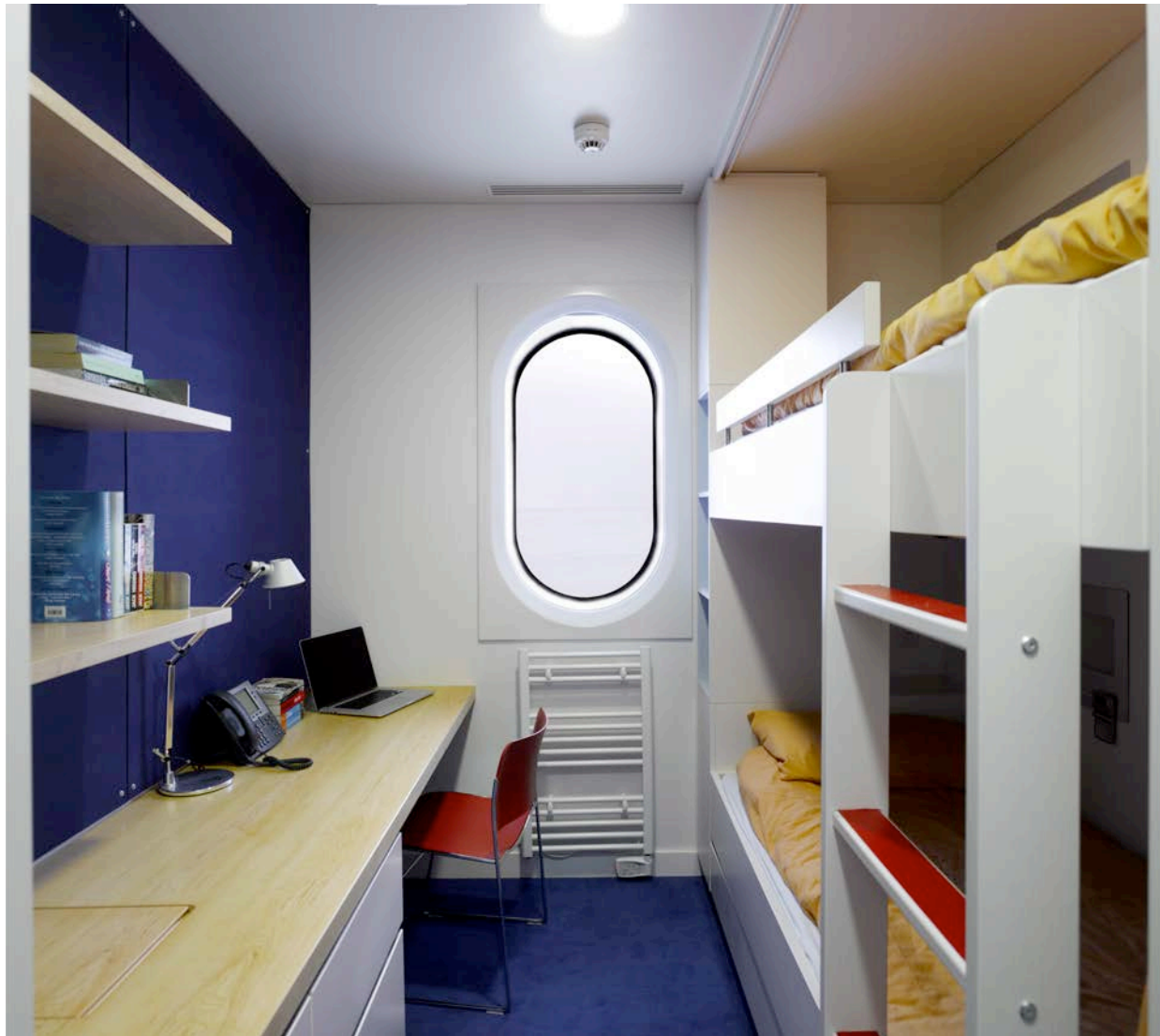
Figure 3. Typical bedroom at Halley VI

Alongside technical innovations, the design also employed old-fashioned architectural principles organizing light and space around human activity. Within the modules a myriad of interior design features were developed to help support the crew through the long dark winters. Bedrooms were designed to be comfortable, but not so comfortable as to erode the sense of community. A quiet room has been included at the north end of the station to provide a space for smaller groups. Large areas of high performance glazing allow views onto the ice and skywards to experience the spectacular auroras. Wherever possible opportunities were sought to address the sensory deprivations suffered by the crew. For example, a spiral stair leading to the upper level of the red module is lined in Lebanese cedar panels, which give off a pleasant natural scent in a place where there are no plants; a colour psychologist was employed to develop a special palette to help combat the debilitating influence of Seasonal Affective Disorder; and within the ergonomic bedrooms, a special alarm clock was developed incorporating daylight simulation lamps to stimulate mood enhancing serotonin production during the long dark winter.