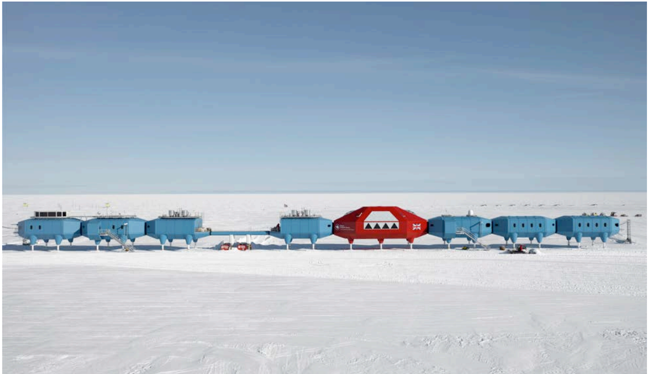
Figure 1. Halley VI Antarctic Research Station on the Brunt Ice Shelf