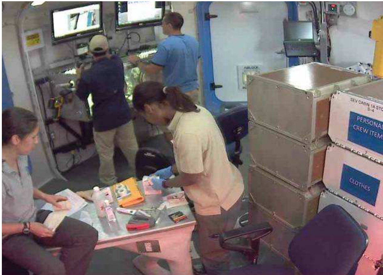
Figure 9. Crewmembers performing tasks at workstations in the HDU-PEM.