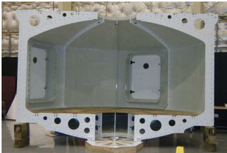
Figure 3. HDU shell buildup with four wedge segments.