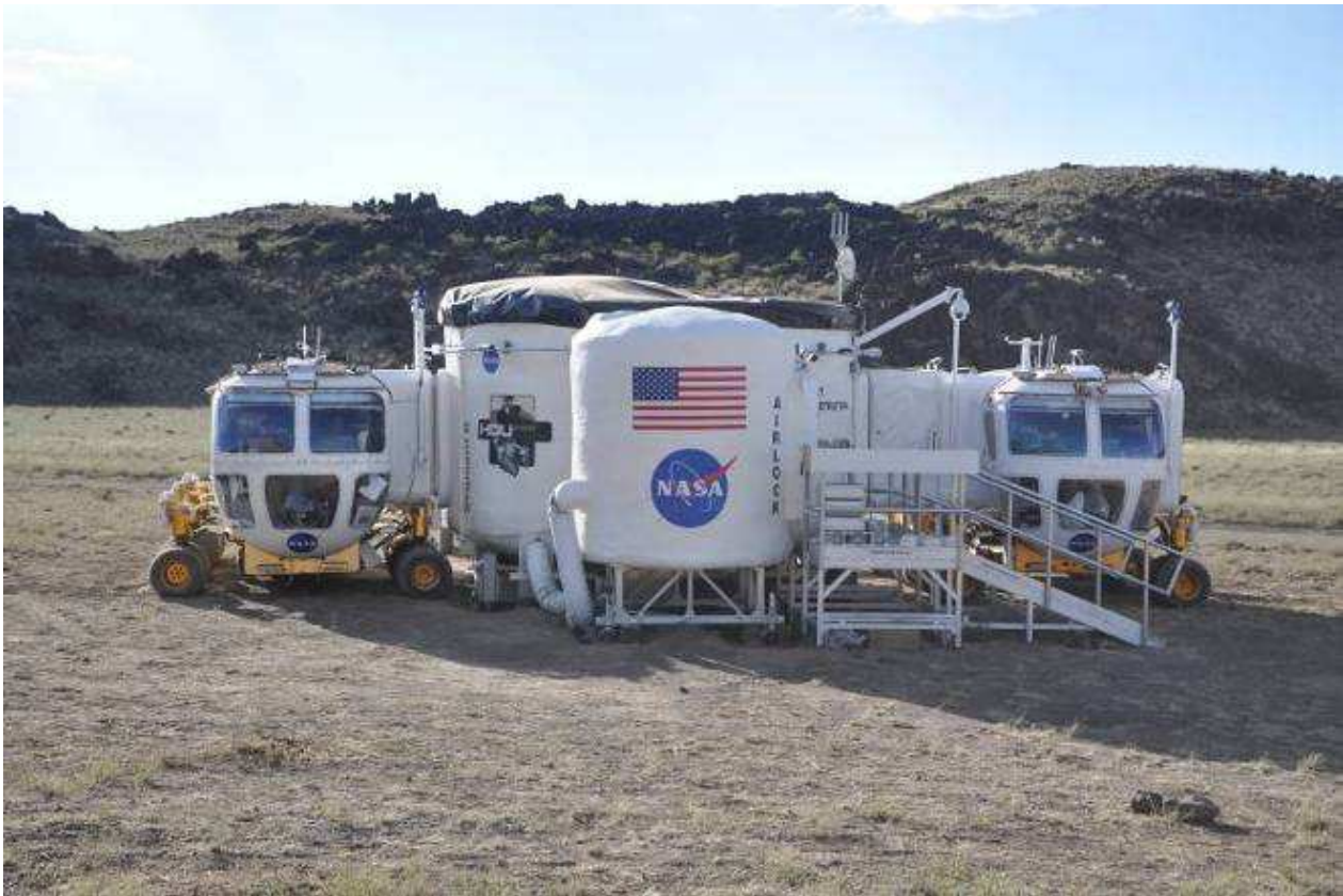
Figure 8. HDU-PEM with dual rover docking at SP Mountain, Arizona (NASA photo, 2010).

The PEM integrated test operations were conducted similarly to the PEM independent test operations, with the exceptions that the test operations were run more like missions from the Mobile Mission Control Center by actual JSC Missions Operations Directorate personnel and that the crews were composed of the integrated crewmembers who spent most of their seven day missions inside the rovers or performing simulated EVAs. The first scheduled integrated test day was Day 7. The two rover crews of two each had docked previously with the PEM on Day 6 and had spent the night sleeping in their respective rovers (see Fig. 8). During Day 7, the crew was devoted to