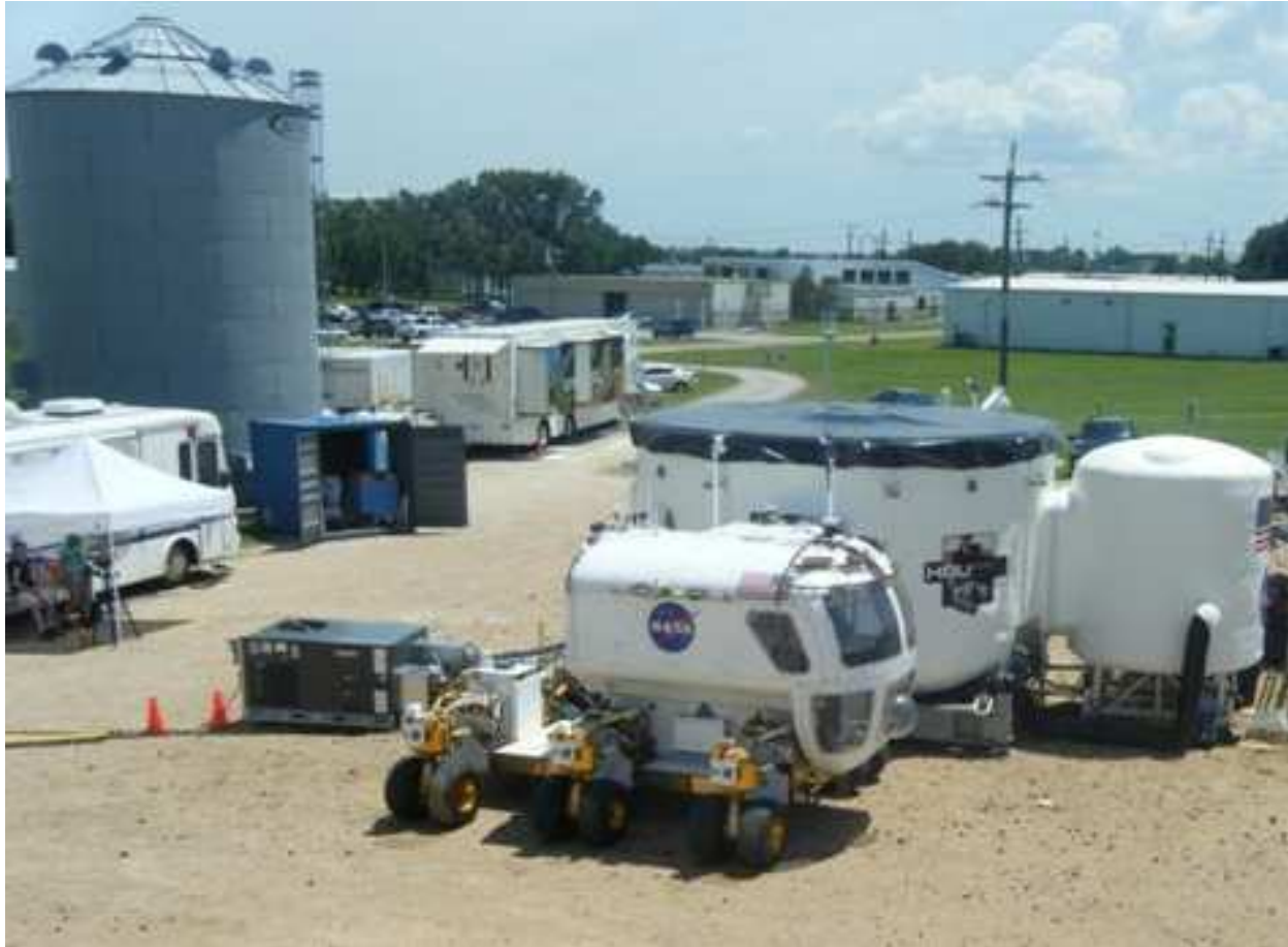
Figure 4. HDU-PEM participating in dry run evaluations at the JSC Rock Yard facility.

separate flat bed truck using only a forklift. After the HDU and Airlock were transported to the Rock Yard, the two were placed onto the simulated terrain, positioned, leveled, and joined together. Once the HDU, Airlock, and all supporting equipment were configured, a portable diesel generator was interfaced to the HDU power subsystem and to the HDU heat pump, providing both power and cooling to the interior of the HDU and Airlock. This was important, due to the fact that several integration items were still unfinished inside the HDU, and it was late July in the hot Houston, Texas, climate. Also integrated with the HDU avionics and communications subsystems was the HDU Command Bus, a reconfigured recreational vehicle formerly used by the U. S. Secret Service as a mobile command post. The Command Bus now served as a portable mission control center for the HDU, housing control and monitoring consoles for key subsystem support personnel. Despite the ongoing testing of its subsystems, the HDU was able to support integrated element testing in the Rock Yard with the two rovers, which repeatedly performed docking and undocking maneuvers with the HDU hatch interfaces—both with and without the Active-Active Mating Adapter (AAMA). Upon successful completion of the Rock Yard dry run testing, the HDU, Airlock, and supporting field equipment were deemed ready for shipment to the analog field test site.