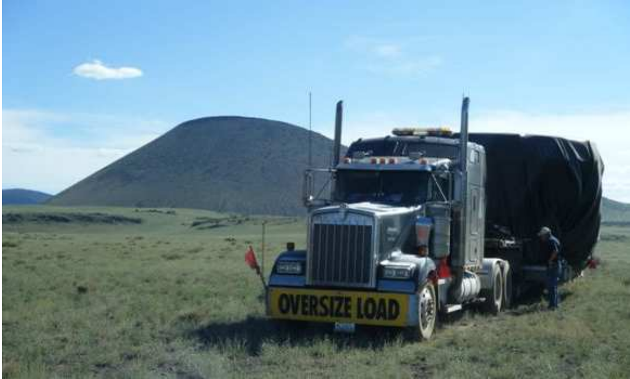
Figure 5. The HDU-PEM, classified as a super wide-load payload, arrives by tractor-trailer at SP Mountain, Arizona.

the Airlock, and the heat pump. All three payloads were securely chained to the trailer, and the HDU and Airlock were additionally tarped to protect them from the elements and road debris during the week-long trip. Second to depart was the Command Bus, which was loaded with equipment and supplies for the field test operations and which was driven by two of the HDU field team members. Last to leave—a week later than the first vehicle—was the standard width tractor-trailer, which carried a small shipping container filled with equipment and supplies, the Airlock porch and ramp, a staircase, and two crated power subsystem modules. On the same day the last vehicle departed from JSC, several advance HDU field team members departed from their respective NASA Centers to rendezvous in Arizona.