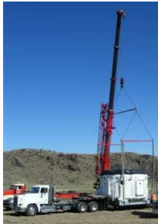
Figure 7. Unloading the PEM (photo by author, 2010).