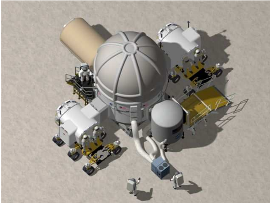
Figure 10. A computer model of the HDU in the Deep Space Habitat configuration.

stuffed mockup space suit was translated from the bottom of the Airlock access ramp, up the ramp, over the porch, and into the Airlock using the Airlock winch, which was operated by a suited test subject. After completion of these final PEM test points in late January 2011, reconfiguration activities began in earnest with the HDU to convert it from the PEM configuration to the Deep Space Habitat configuration in support of the Desert RATS 2011 field campaign (see Figure 10) 4 .