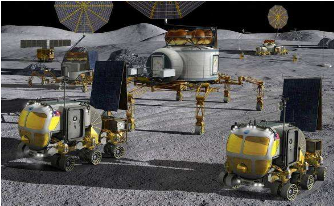
Figure 1. Artist's concept of LAT 12.1 mission architecture.

the HDU Project's first-generation shell consisted of a 5-meter diameter vertical axis cylinder with a domed top and bottom constructed of eight wedge sections. The shell had four rectangular hatches spaced at 90 degree intervals along the cylindrical outer wall of the shell (corresponding to the LAT 12.1 architectural concept for the Pressurized Core Module) and a circular hatch at the center of the upper dome for access to a future upper deck loft. Flooring was included in the design both inside the shell and on top of it, forming an upper deck for the anticipated loft addition. The entire HDU shell sat on a square support cradle which had four leveling legs and associated foot pads. An attached Airlock module was included in the conceptual design.