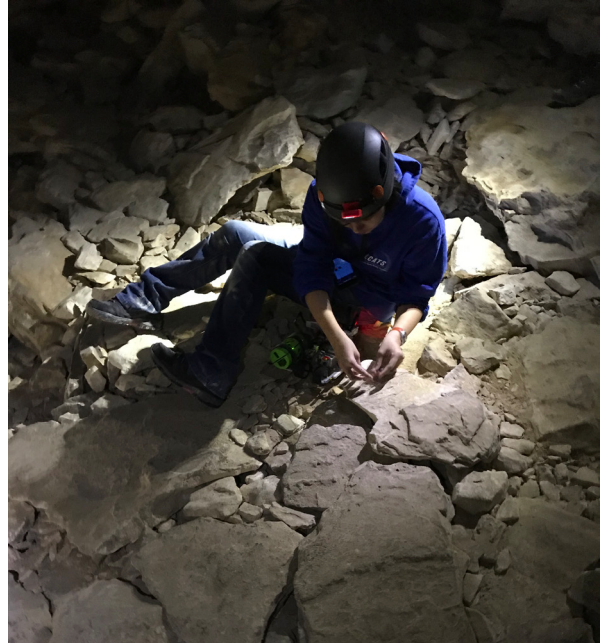
Figure 5. Robotics Field Test in Cave Environment

Student projects and curricula of the LCATS program are attached to actual technology, engineering and science investigation challenges associated with the growth phases of human settlement at the Marius Hills Skylight. The LEAP2 commercial lunar site development program provides a framework for LCATS project-based curricula development to be aligned with the goals of the commercial venture for actual development of the lunar site [7].