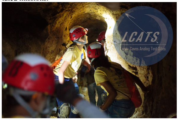
Figure 2. LCATS Student Field Trips to Local Caves

Introduction: Inspiring the next generation of space explorers is a major objective for the scientists, engineers, and educators of today. To improve Space-STEM teaching and student comprehension, we have created the Lunar Caves Analog Test Sites (LCATS) program for science investigations, space exploration mission operations, technology development, and habitability system architectures. The LCATS program environment incorporates a pipeline of motivated middle and high school students to assist professionals in solving real-world challenges in space-exploration technology. Critical thinking, problem solving skills, teamwork, and mentoring enhance the student experience. Learning performance benefits from the use of robotic technologies, terrestrial analogs for testing technology projects and operational processes in a mission context. Local Texas caves in the area and region are utilized as analog environments for fielding student experiments and technology challenges through simulated missions.