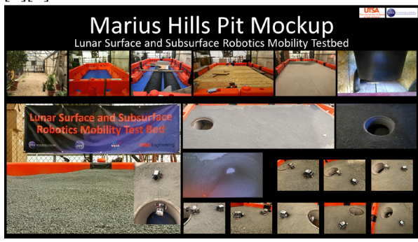
Figure 4. Lunar Surface/Subsurface Robotics Testbed

tion [2]. LCATS provides real-world context for students to assist aerospace professionals with solving actual space exploration technology development challenges using project-based curricula. The benefit of project-based educational programs is quite established [3][4]. Project-based learning, a teaching methodology that utilizes student-centered projects to facilitate student learning, is touted as superior to traditional teaching methods in improving problem solving and thinking skills, and engaging students in their learning [5][6].